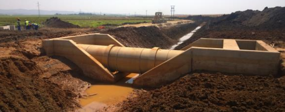
TRONOX (formerly Exxaro)– R600 million Movement of Mine Infrastructure from Hillendale to Fairbreeze