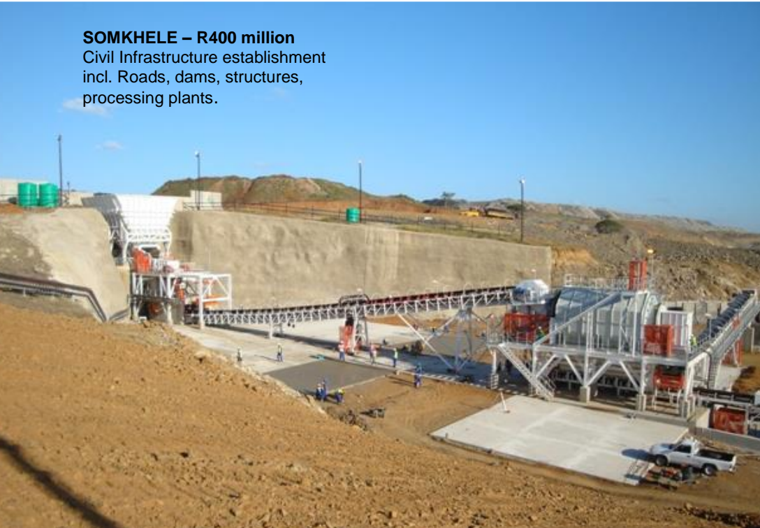
SOMKHELE – R400 million Civil Infrastructure establishment incl. Roads, dams, structures, processing plants.